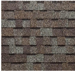
548 – Natural Stone