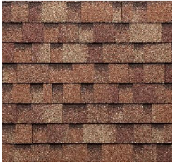
504 – Terracotta