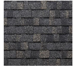
167 – Ancient Stone