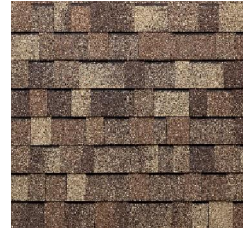
129 – Wooden Shake