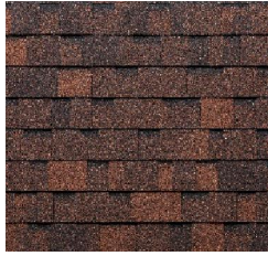
511 – Leather