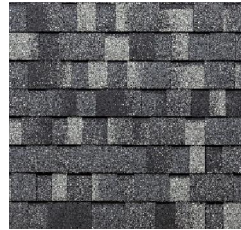
151 – Dark Slate