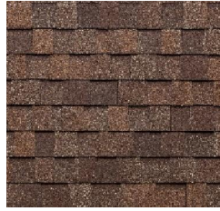
122 – Bark