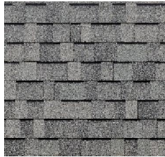
553 – Light Slate