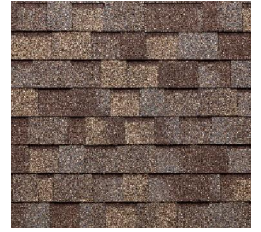
427 – Antique Wood