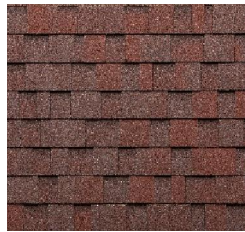
519 - Red Mapled