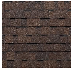
532 - Coffee