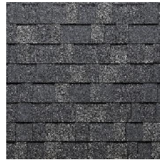
160 - Dark Slate