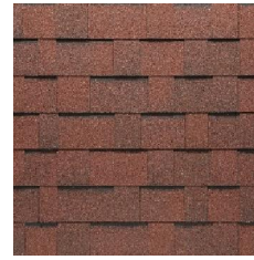
400 - Antique Red