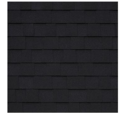
562 - Charcoal