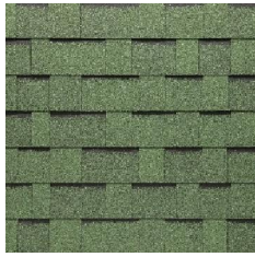
070 - 2 Tone Green