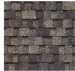
534 - Oakwood