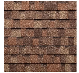
505 - Terracotta