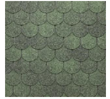
473 - Shaded Green