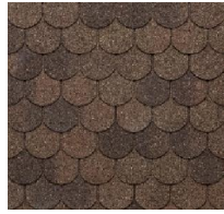
535 - Shaded Brown