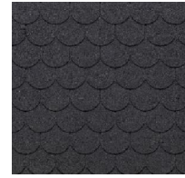
060 – Black