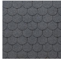
061 - Slate Grey