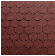
001 – Unired