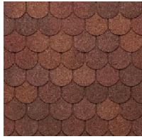
506 – Terracotta