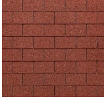
508 - Purple Red