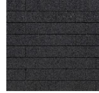
060 - Black