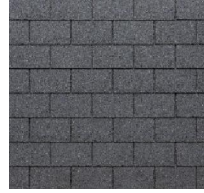
061 - Slate Grey