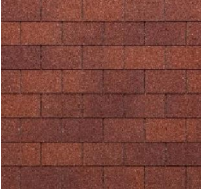
507 - Shaded Red