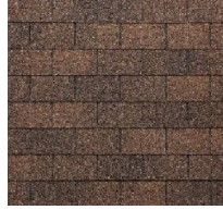
434 - Shaded Brown