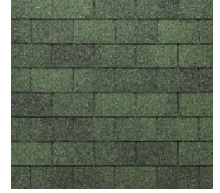
473 - Shaded Green