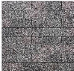
550 – Dark Grey