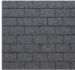
061 – Slate Grey