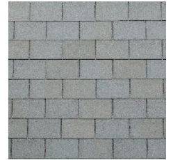
053 – Light Grey