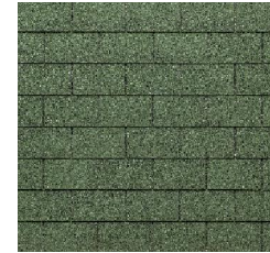
070 – Tone Green