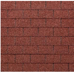
503 – Coppery Red