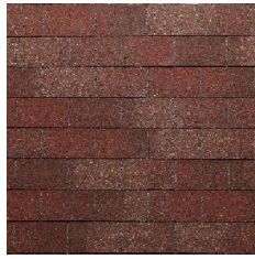
002 – Tone Red