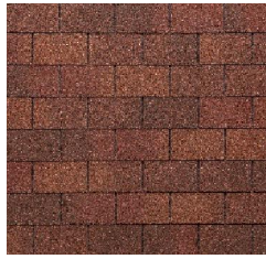
506 – Autumn Red