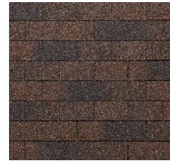
547 – Woodbrown