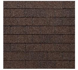
521 – Dark Brown