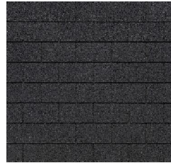
060 – Black