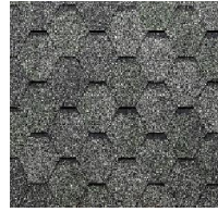
569 – Granite