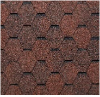
512 – Tiziano Red