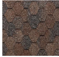
522 – Arabica