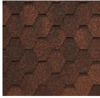
227 – Nuanced Brown