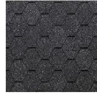
561 – Dark