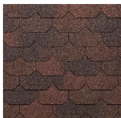
515 – Leather