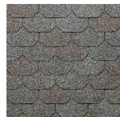
567 - Losa