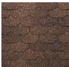
530 – Nuanced Brown