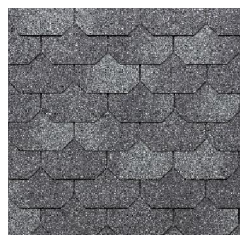
464 – Slate Grey