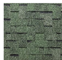
574 – Marine Green