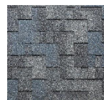
584 – Ice Blue