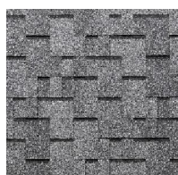
554 – Granite