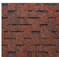
510 – Tiziano Red