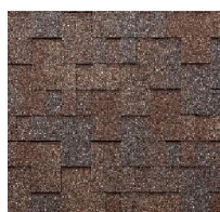
421 – Arabica