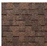
522 – Wood