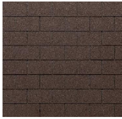
032 – Mixed Brown