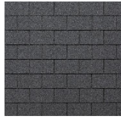
065 – Mixed Slate