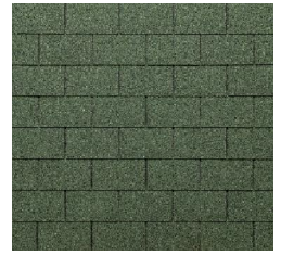
078 – Mixed Green