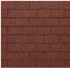
013 – Mixed Red