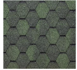
279 – Shaded Green