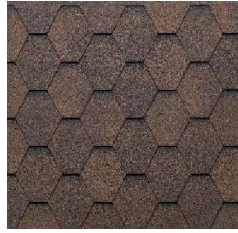
239 – Shaded Brown