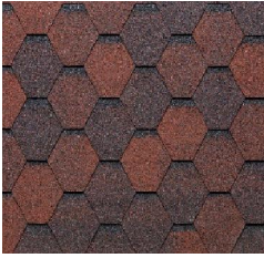
509 – Shaded Red